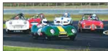
Vintage is the race theme the weekend of May 30 at the New Jersey Motorsports Park in Millville. NJMP also hosts a community fair the same weekend.

Drive-In to Downtown Millville: On March 29 a parade of vintage cars will leave NJMP around 6 p.m. and drive to High Street in the Holly City.