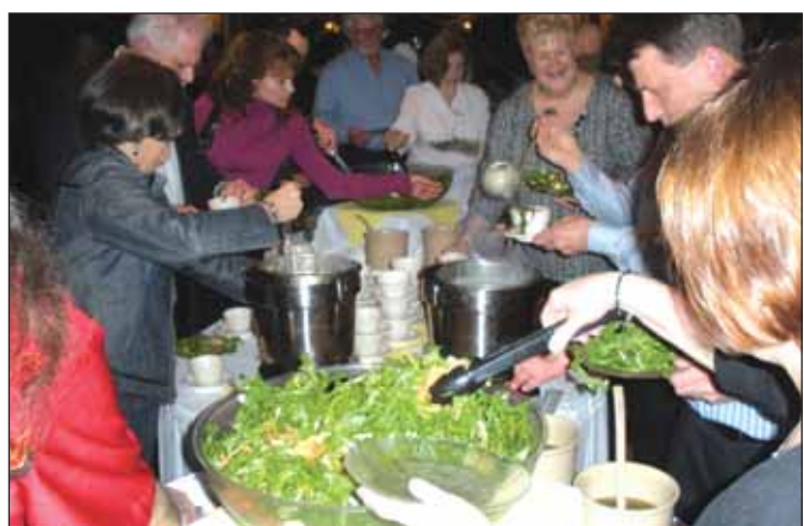
It's only appropriate that a salad be served at the Dandelion dinner.

Vineland's agricultural heritage and has contributed to international recognition of the city as "the Dandelion Capital of the World."