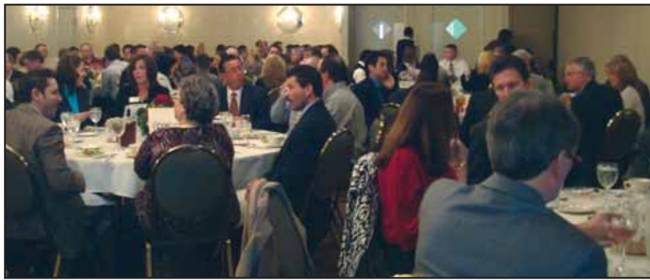
A sizable turnout was realized during the Greater Vineland Chamber of Commerce's monthly luncheon held March 19 at the Ramada Inn. Speakers were 1st District legislators.

"The state takes your money, they process it, they pay people to write checks and write the checks