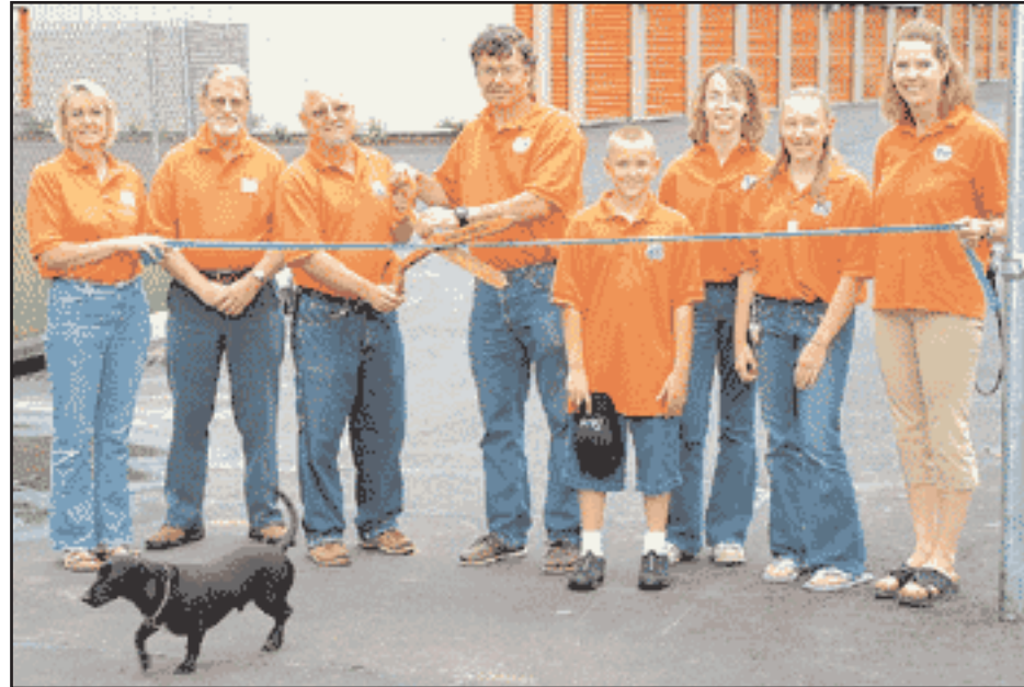
The Route 55 Self Storage crew observes its grand opening with a ribbon cutting at the facility at 4281 S. Lincoln Ave.

■ Merighi's Savoy Inn presents "The Godfather's Meshuggener Wedding," a Jewish/Italian audience participation comedy, on July 17 at 7 p.m. The evening includes food, dancing and live music. Tickets are $60 each or $55 for groups of 10 or more.