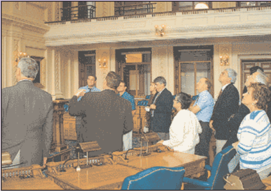
Chamber members who participated in the "Trip to Trenton" admire the vastness of the State House.

As explained by Senator Asselta, a bill becomes law when it is approved by a majority of the authorized members (21 votes in the Senate, 41 in the Assembly) and signed by the Governor. The process works as follows: At a legislator's direction, the Office of Legislative Services, a non-partisan agency of the Legislature, provides research and drafting assistance, and prepares the bill in proper technical form. The bill is then introduced, known